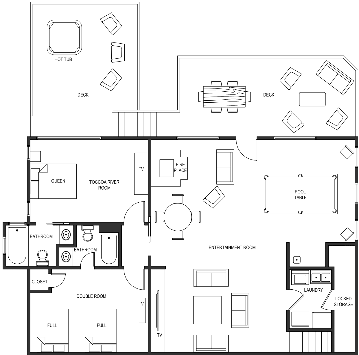
A EXISTING BASEMENT FLOOR PLAN SCALE: 1/8" = 1'-0"