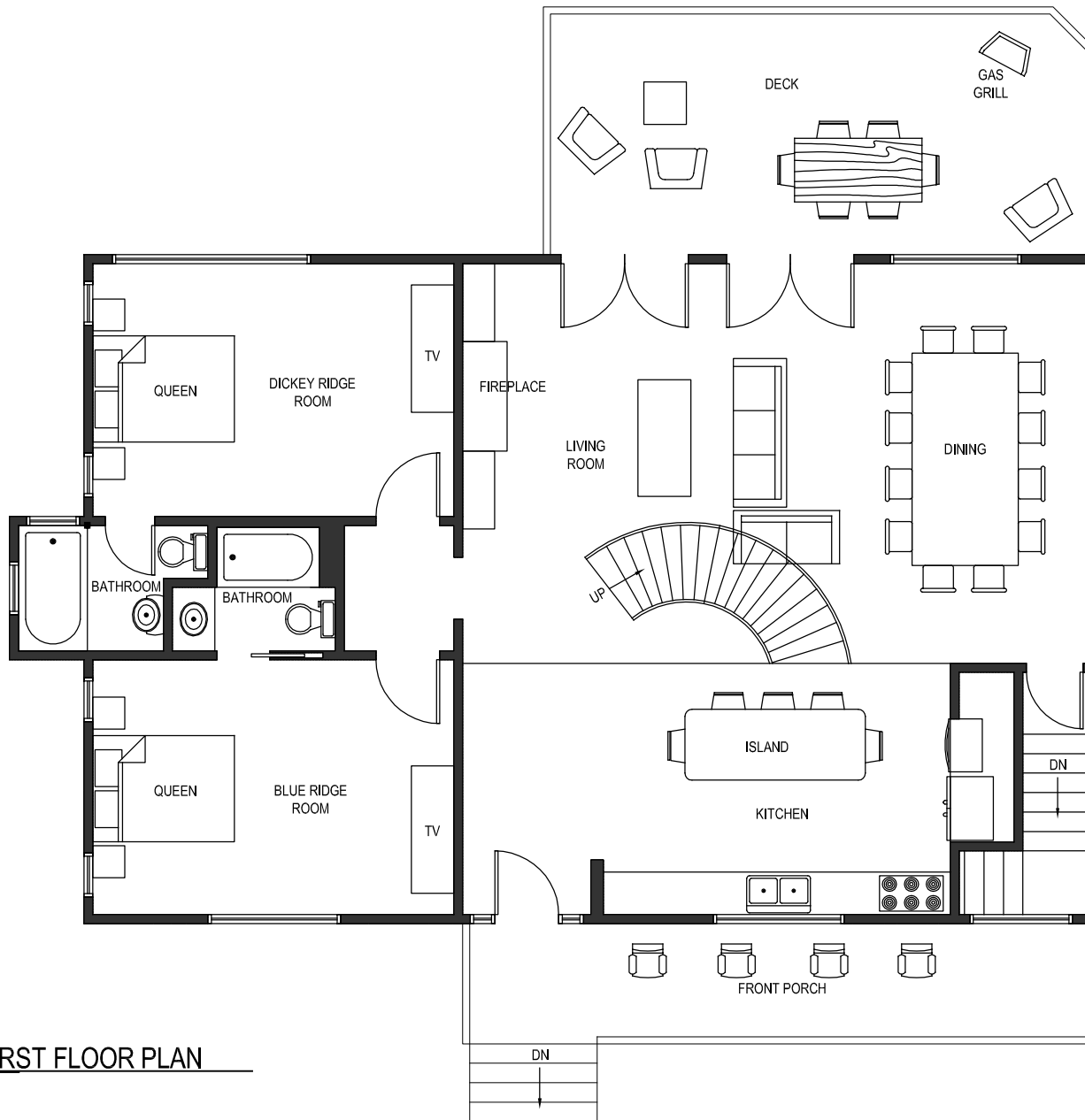
A EXISTING FIRST FLOOR PLAN SCALE: 1/8" = 1'-0"