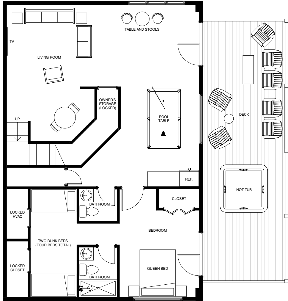
A BASEMENT FLOOR PLAN Scale: 1/8" = 1'-0"